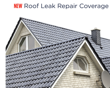
NEW Roof Leak Repair Coverage

An American Home Shield home warranty covers the repair or replacement of many major components of home systems and appliances, but not necessarily the entire system or appliance. Limitations and exclusions apply. See agreement for details.