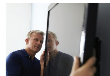
Smart Home Tech Installation and Setup Services